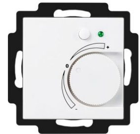
WRF07 P TD

(Illustration shows Insert switch program with support ring, frame optionally available depending on switch program range)